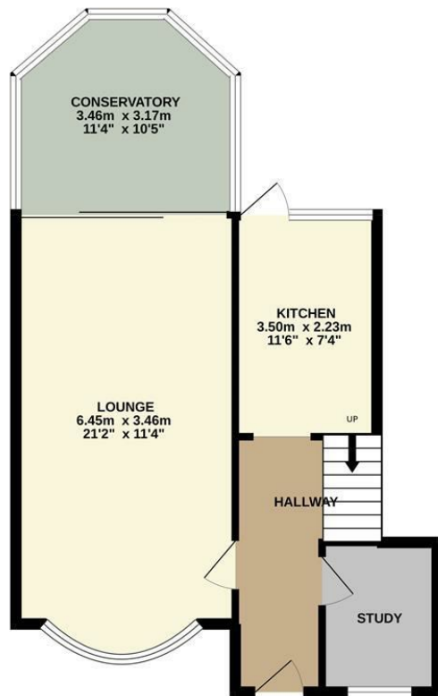
GROUND FLOOR 52.2 sq.m. (562 sq.ft.) approx.